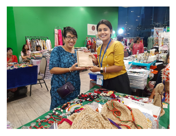
September 23- 25 Exhibition Mani Square, Salt Lake