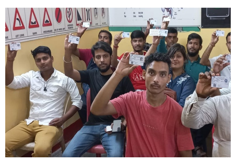
New drivers in our Kolkata class hold their driver's licenses