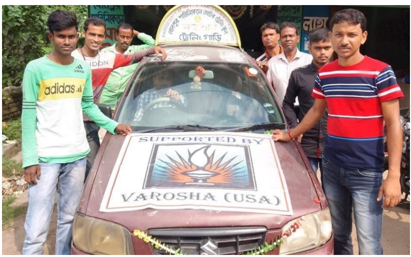
Drivers' Education students in Birbhum

One of our students in Birbhum, Ujjal L, recently purchased a second hand tractor and is earning Rs 10k/ month. Nearly all our students were able to pass their driving tests on their first try and the very few who did not are ready to try again. They can see a positive and hopeful future with this valuable skill.