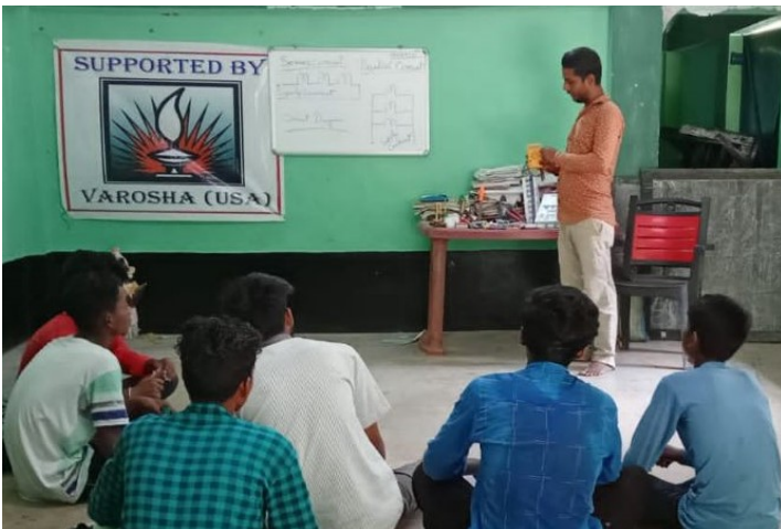
Young men attending electrician training class in Huchukpara