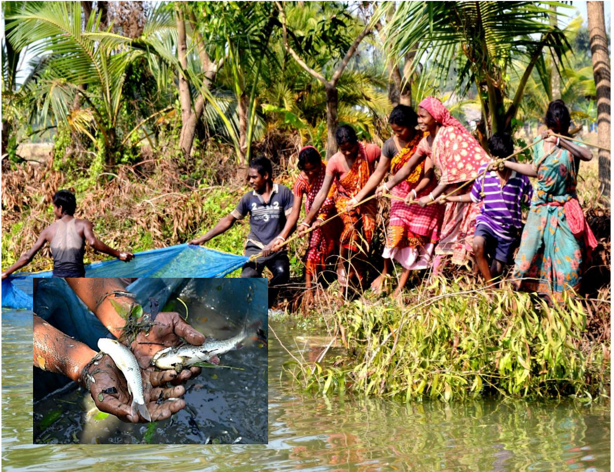
VAROSHA “Aranyer Alo”, an Aqua-culture project in S 24 Parganas, W Bengal

“Let me light my lamp”, says the star, “and never debate if it will help to remove the darkness”.