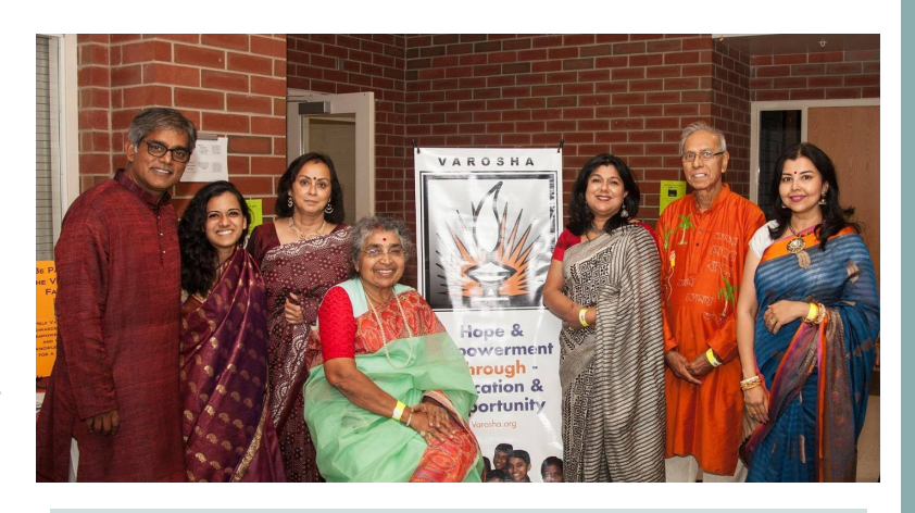
Because of your generosity Varosha has helped improve the lives of over 2000 people. From all of us at Varosha, THANK YOU for your support!